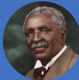
George Washington Carver

Father of Hybrid Rice Recipient of World Food Prize