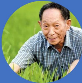
Yuan Longping (袁隆平)

Father of Green Revolution Recipient of the Nobel Peace Prize